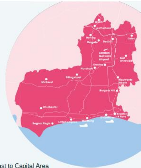
Coast to Capital Area